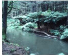
T11056 Aire River Camping Ground