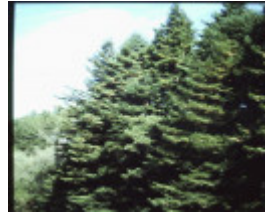
T11056 Sequoia sempervirens