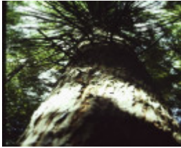
T11056 Sequoia sempervirens