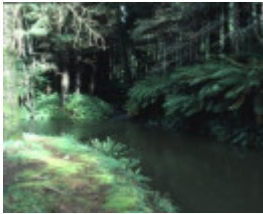
T11056 Aire River Camping Ground