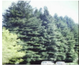
T11056 Sequoia sempervirens