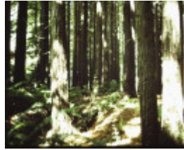
T11056 Sequoia sempervirens