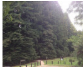
T11056 Sequoia sempervirens 3/2015