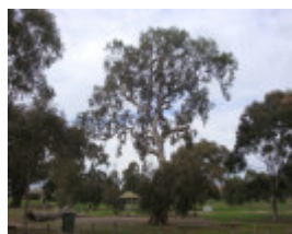
T11081 Eucalyptus camaldulensis