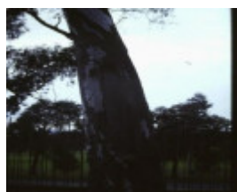
T11081 Eucalyptus camaldulensis