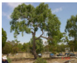
T11081 Eucalyptus camaldulensis