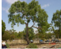
T11081 Eucalyptus camaldulensis