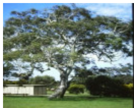
T11081 Eucalyptus camaldulensis