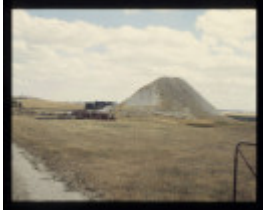
BERRY UNITED MINE