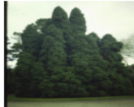
T11136 Cryptomeria japonica 'Elegans'