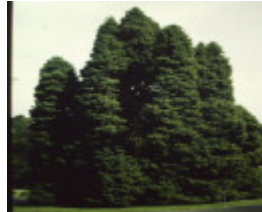
T11136 Cryptomeria japonica 'Elegans'