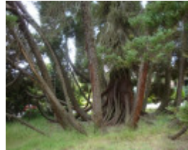
T11136 Cryptomeria japonica 'Elegans'