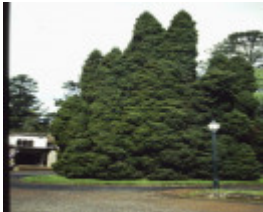
T11136 Cryptomeria japonica 'Elegans'