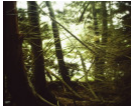
T11136 Cryptomeria japonica 'Elegans'