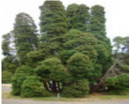
T11136 Cryptomeria japonica 'Elegans'