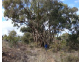
T11161 Eucalyptus melliodora