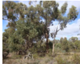
T11161 Eucalyptus melliodora western tree