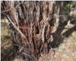
T11161 Eucalyptus melliodora trunk