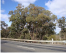
T11161 Eucalyptus melliodora