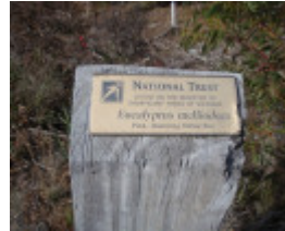
T11161 Eucalyptus melliodora