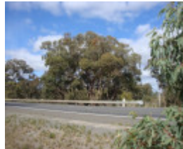
T11161 Eucalyptus melliodora