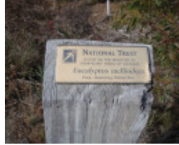
T11161 Eucalyptus melliodora