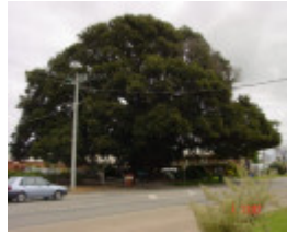
T11171 Ficus macrophylla