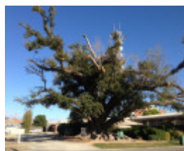
T11171 Ficus macrophylla