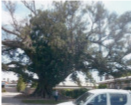
T11171 Moreton Bay Fig 22 Oct 2011