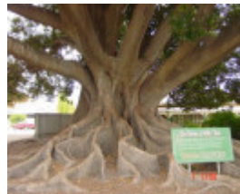
T11171 Ficus macrophylla