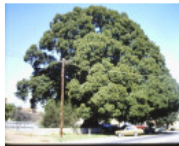
T11171 Ficus macrophylla