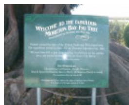
T11171 Ficus macrophylla sign