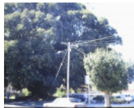
T11171 Ficus macrophylla