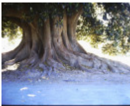
T11171 Ficus macrophylla