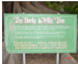
T11171 Ficus macrophylla