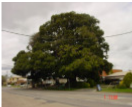
T11171 Ficus macrophylla