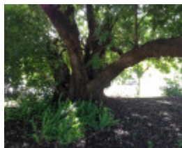
T11172 Ceratonia siliqua