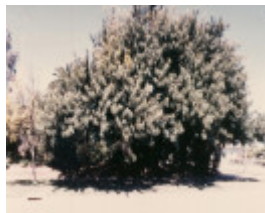
T11172 Ceratonia siliqua Swan Hill