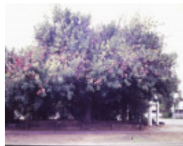
T11172 Ceratonia siliqua