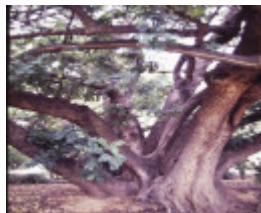
T11172 Ceratonia siliqua