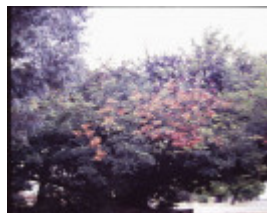
T11172 Ceratonia siliqua