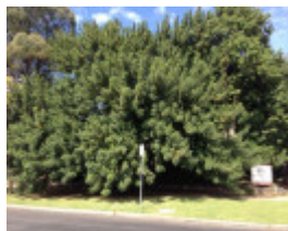
T11172 Ceratonia siliqua