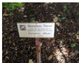
T11172 Ceratonia siliqua sign