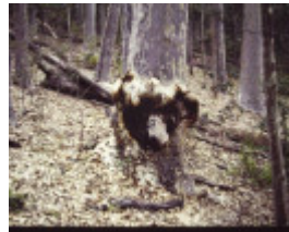
T11186 Corymbia maculata