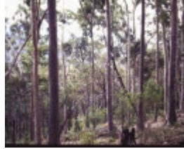
T11186 Corymbia maculata