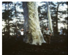
T11186 Corymbia maculata