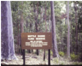
T11186 Corymbia maculata