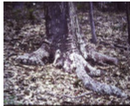
T11186 Corymbia maculata