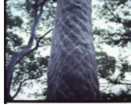
T11186 Corymbia maculata