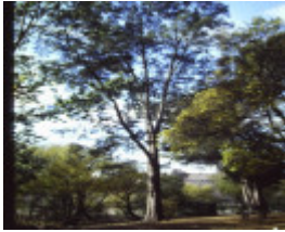
T11188 Casuarina cunninghamiana