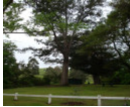
T11188 Casuarina cunninghamiana