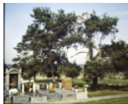
T11196 Pinus sylvestris