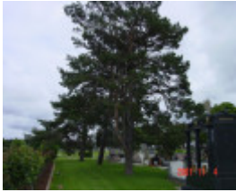
T11196 Pinus sylvestris