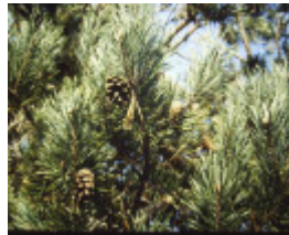
T11196 Pinus sylvestris