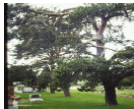
T11196 Pinus sylvestris