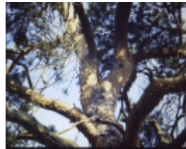
T11196 Pinus sylvestris