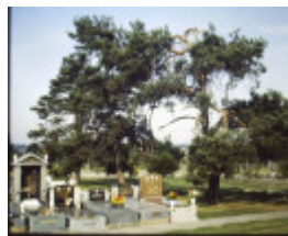
T11196 Pinus sylvestris