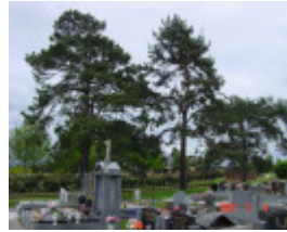
T11196 Pinus sylvestris