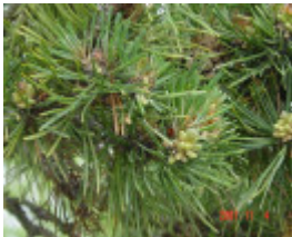
T11196 Pinus sylvestris