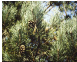
T11196 Pinus sylvestris