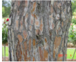
T11196 Pinus sylvestris