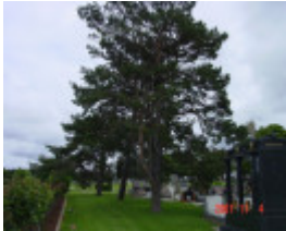
T11196 Pinus sylvestris