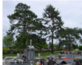
T11196 Pinus sylvestris