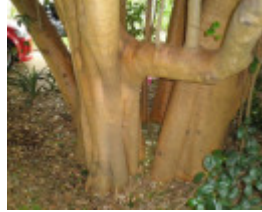
T11240 Elaeodendron croceum