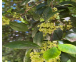
Werribee Park trees - 55