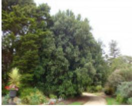
T11240 Elaeodendron croceum