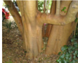
T11240 Elaeodendron croceum