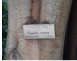
T11240 Elaeodendron croceum