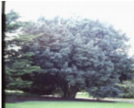
T11240 Elaeodendron croceum