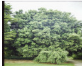
T11240 Elaeodendron croceum