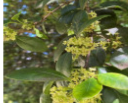
Werribee Park trees - 55