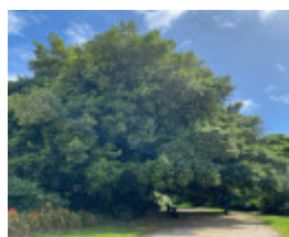
Werribee Park trees - 50