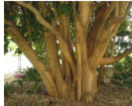
T11240 Elaeodendron croceum