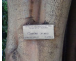
T11240 Elaeodendron croceum