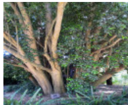
Werribee Park trees - 48