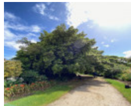
Werribee Park trees - 49