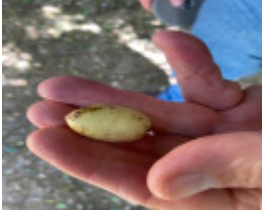
Werribee Park trees - 52