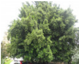
T11240 Elaeodendron croceum