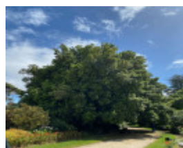
Werribee Park trees - 51