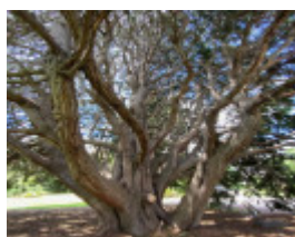
Werribee Park trees - 63