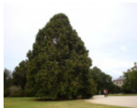
T11242 Cupressus torulosa Werribee