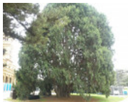
T11242 Cupressus torulosa 2011