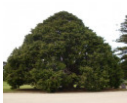
T11242 Cupressus torulosa Werribee