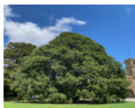
Werribee Park trees - 64