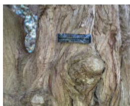
Werribee Park trees - 65