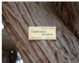
T11242 Cupressus torulosa Werribee