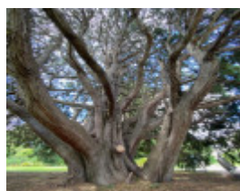
Werribee Park trees - 62