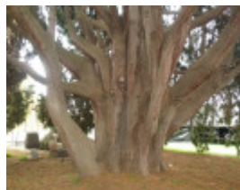
T11242 Cupressus torulosa 2011