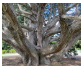
Werribee Park trees - 59