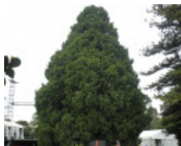
T11242 Cupressus torulosa 2011