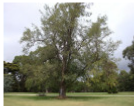
T11243 Ulmus minor 'Variegata'