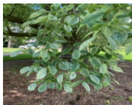
Werribee Park trees - 90