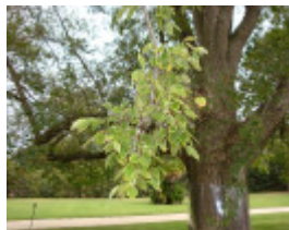
T11243 Ulmus minor 'Variegata'