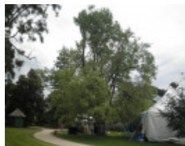
T11243 Ulmus minor 'Variegata'