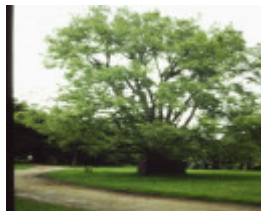
T11243 Ulmus minor 'Variegata'