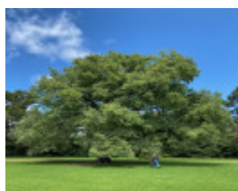
Werribee Park trees - 84