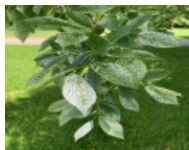
Werribee Park trees - 89