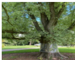
Werribee Park trees - 87