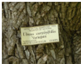
T11243 Ulmus minor 'Variegata'