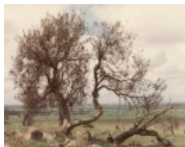
T11247 Banksia marginata Eynesbury