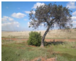
T11247 Banksia marginata Eynesbury