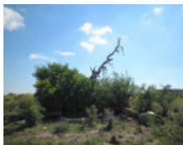
T11247 Banksia marginata Eynesbury