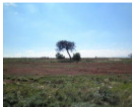
T11247 Banksia marginata Eynesbury