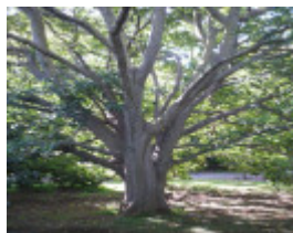
T11248 Calodendrum capense