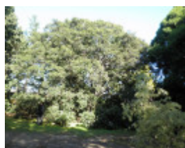
T11248 Calodendrum capense