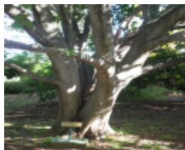
T11248 Calodendrum capense