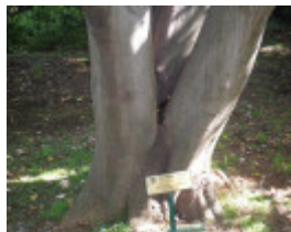
T11248 Calodendrum capense