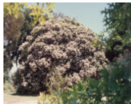
T11248 Calodendron capense