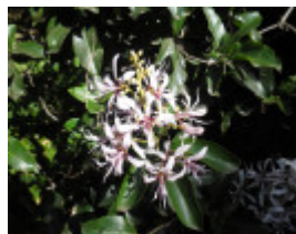
T11248 Calodendrum capense