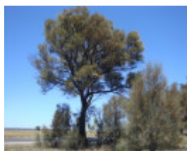
T11272 Casuarina obesa