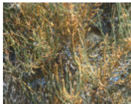
T11272 Casuarina obesa