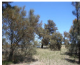
T11272 Casuarina obesa