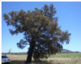
T11272 Casuarina obesa