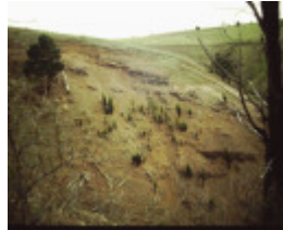
T11286 Callitris glaucophylla