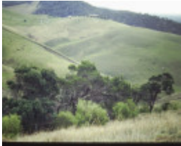
T11286 Callitris glaucophylla