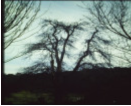
T11290 Pyrus communis