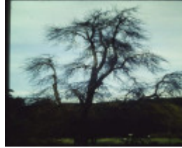
T11290 Pyrus communis