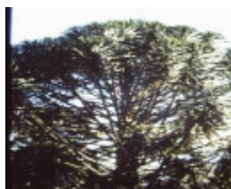
T11293 Araucaria biwilli