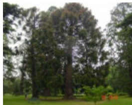
T11293 Araucaria biwilli