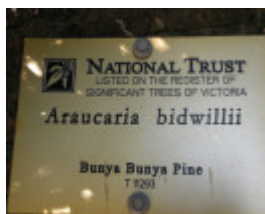
T11293 Araucaria biwilli