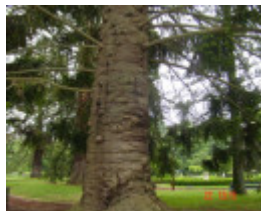
T11293 Araucaria biwilli