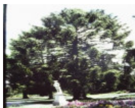
T11293 Araucaria biwilli