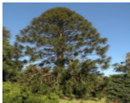
T11293 Araucaria biwilli