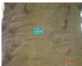
T11293 Araucaria biwilli