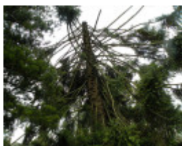
T11293 Araucaria biwilli