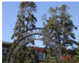
T11307 Cedrus atlantica f. glauca