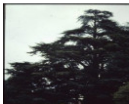
T11307 Cedrus atlantica f. glauca