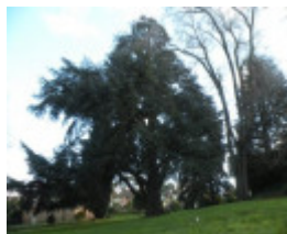
T11307 Cedrus atlantica f. glauca