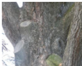
T11307 Cedrus atlantica f. glauca