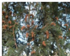
T11307 Cedrus atlantica f. glauca