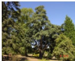
T11307 Cedrus atlantica f. glauca