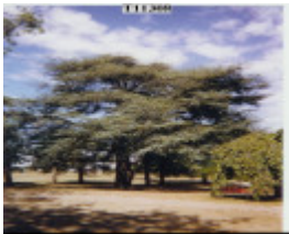
Cedrus atlantica f. glauca