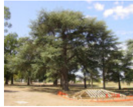
Cedrus atlantica f. glauca