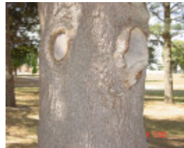
Cedrus atlantica f. glauca