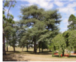
Cedrus atlantica f. glauca