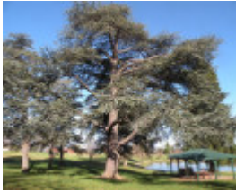
Cedrus atlantica f. glauca