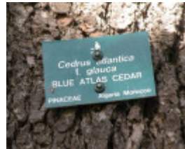
Cedrus atlantica f. glauca