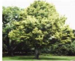
T11320 Ulmus x hollandica 'Wredei'