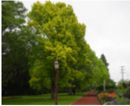
T11320 Ulmus x hollandica 'Wredei'