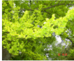
T11320 Ulmus x hollandica 'Wredei'