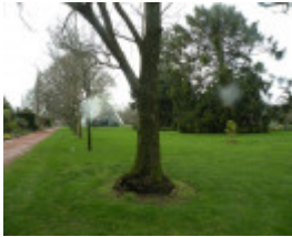
T11320 Ulmus x hollandica 'Wredei' winter