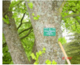
T11320 Ulmus x hollandica 'Wredei'