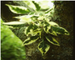
T11323 Fraxinus excelsior 'Auereo-variegata'