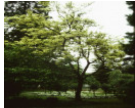
T11323 Fraxinus excelsior 'Auereo-variegata'