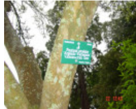
T11323 Fraxinus excelsior 'Auereo-variegata'