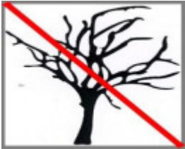
T11323 Fraxinus excelsior 'Auereo-variegata'