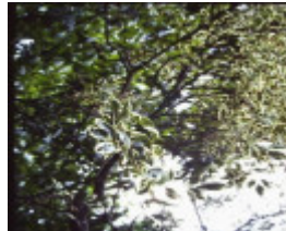
T11323 Fraxinus excelsior 'Auereo-variegata'