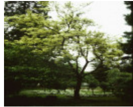
T11323 Fraxinus excelsior 'Auereo-variegata'