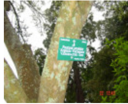
T11323 Fraxinus excelsior 'Auereo-variegata'