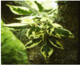
T11323 Fraxinus excelsior 'Auereo-variegata'