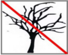
T11323 Fraxinus excelsior 'Auereo-variegata'