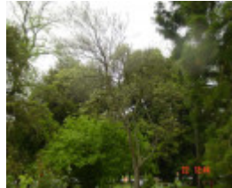
T11323 Fraxinus excelsior 'Auereo-variegata'