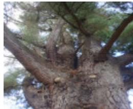
T11337 Pinus radiata