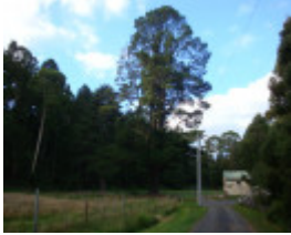
T11337 Pinus radiata