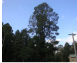
T11337 Pinus radiata