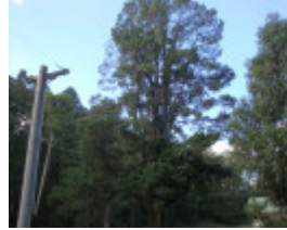
T11337 Pinus radiata