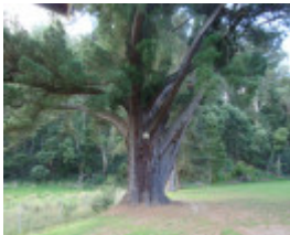
T11337 Pinus radiata