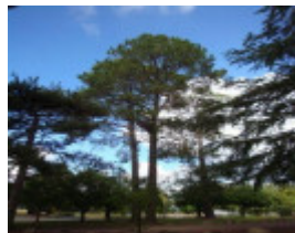
T11349 Pinus taeda