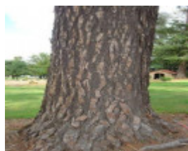
T11349 Pinus taeda