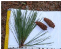
T11349 Pinus taeda