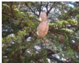
T11354 Cedrus atlantica f. glauca