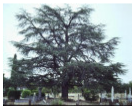
T11354 Cedrus atlantica f. glauca