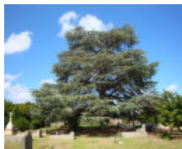
T11354 Cedrus atlantica f. glauca