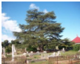
T11354 Cedrus atlantica f. glauca