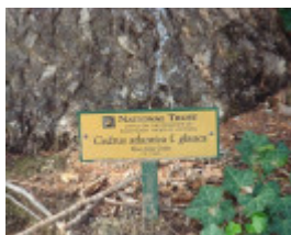
T11354 Cedrus atlantica f. glauca