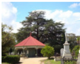
T11354 Cedrus atlantica f. glauca