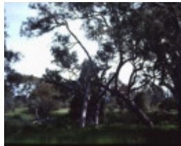
T11371 Eucalyptus cadens