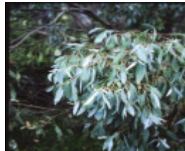
T11371 Eucalyptus cadens