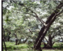
T11371 Eucalyptus cadens