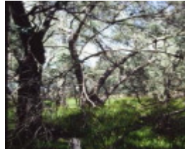
T11371 Eucalyptus cadens