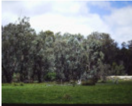
T11371 Eucalyptus cadens