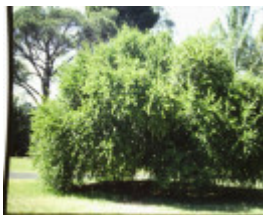
T11374 Acacia karoo