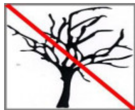
T11374 Tree removed 2012