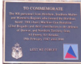
T11374 Acacia karoo