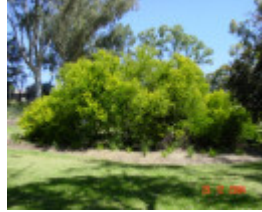
T11374 Acacia karoo