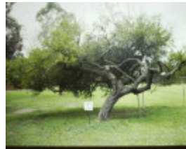
T11374 Acacia karoo