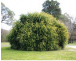
T11374 Acacia karoo