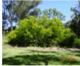
T11374 Acacia karoo