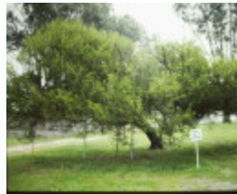
T11374 Acacia karoo