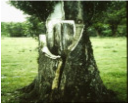
T11399 Populus nigra italica