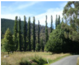
T11399 Populus nigra italica distance from south