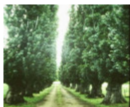
T11399 Populus nigra italica