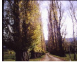
T11399 Populus nigra italica