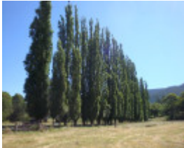
T11399 Populus nigra italica distance from south