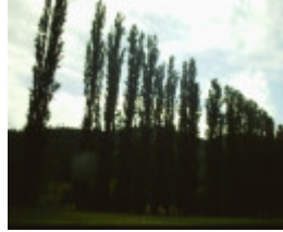
T11399 Populus nigra italica