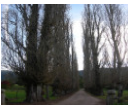
T11399 Populus nigra italica