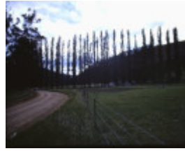
T11399 Populus nigra italica