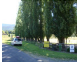
T11399 Populus nigra italica