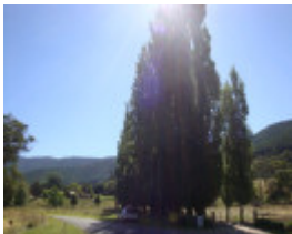
T11399 Populus nigra italica