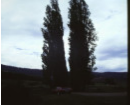
T11399 Populus nigra italica