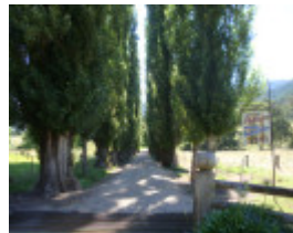
T11399 Populus nigra italica