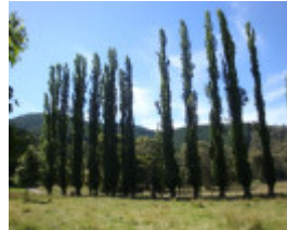
T11399 Populus nigra italica