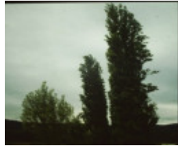
T11399 Populus nigra italica