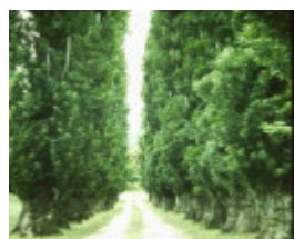
T11399 Populus nigra italica