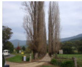
T11399 Populus nigra italica