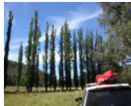
T11399 Populus nigra italica