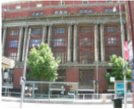
FORMER MAIL EXCHANGE SOHE 2008