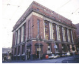
1 former mail exchange bourke street melbourne side corner elevation jun1997