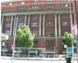
FORMER MAIL EXCHANGE SOHE 2008