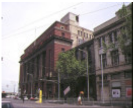
former mail exchange bourke street melbourne rear view