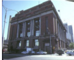
former mail exchange bourke street melbourne side view jan1978