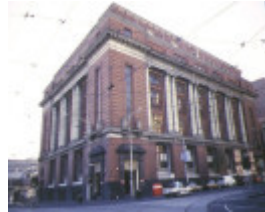
1 former mail exchange bourke street melbourne side corner elevation jun1997