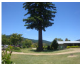
T11400 Sequoia sempervirens