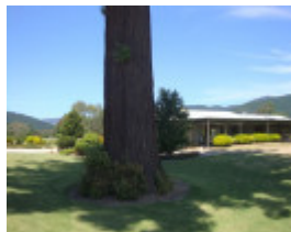
T11400 Sequoia sempervirens trunk