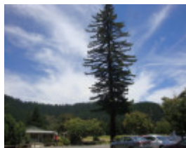
T11400 Sequoia sempervirens