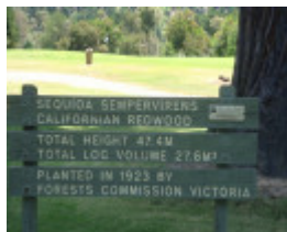
T11400 Sequoia sempervirens sign