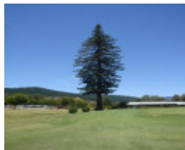
T11400 Sequoia sempervirens