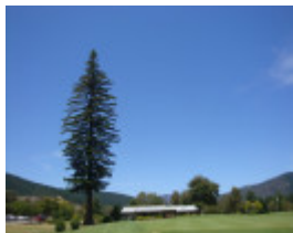
T11400 Sequoia sempervirens