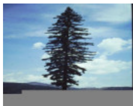
T11400 Sequoia sempervirens