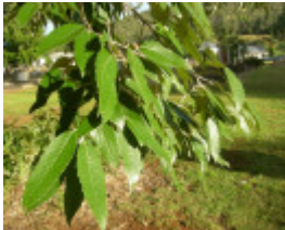
T11401 Quercus leucotrichophora