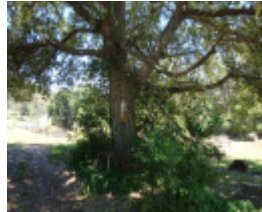
T11401 Quercus leucotrichophora