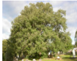
T11401 Quercus leucotrichophora