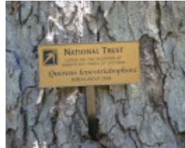
T11401 Quercus leucotrichophora plaque