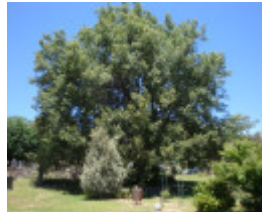
T11401 Quercus leucotrichophora