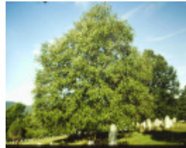
T11401 Quercus leucotrichophora