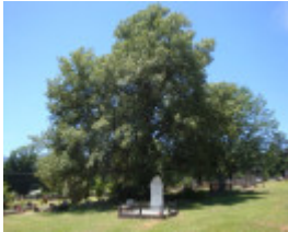
T11401 Quercus leucotrichophora