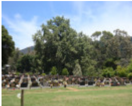
T11401 Quercus leucotrichophora