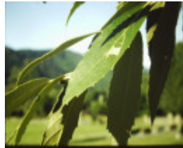
T11401 Quercus leucotrichophora