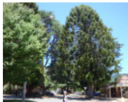
T11403 Cedrus deodara et alia