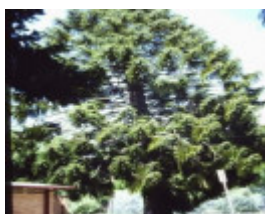
T11403 Cedrus deodara et alia