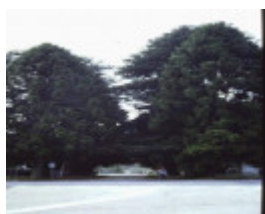
T11403 Cedrus deodara et alia