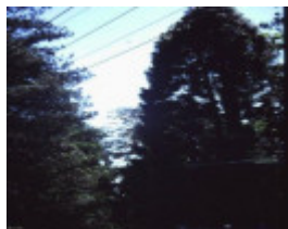
T11403 Cedrus deodara et alia