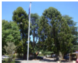
T11403 Cedrus deodara et alia