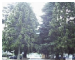
T11403 Cedrus deodara et alia