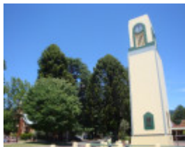
T11403 Cedrus deodara et alia