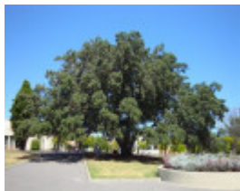
T11405 Quercus suber