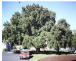
T11405 Quercus suber