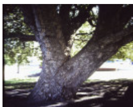
T11405 Quercus suber