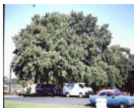
T11405 Quercus suber