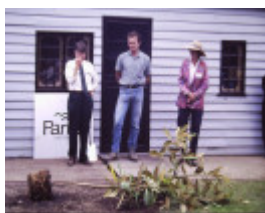
T11419 Magnolia grandiflora planting