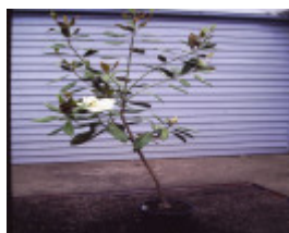
T11419 Magnolia grandiflora