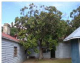
T11419 Magnolia grandiflora