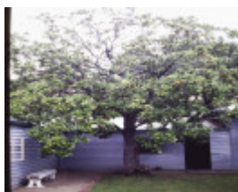
T11419 Magnolia grandiflora