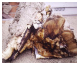
T11419 Magnolia grandiflora removed.JPG