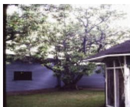
T11419 Magnolia grandiflora