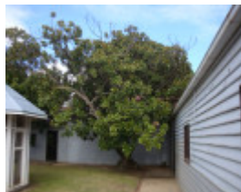
T11419 Magnolia grandiflora