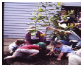
T11419 Magnolia grandiflora planting J Edmondson