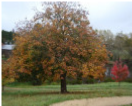
T11436 Acer platanoides