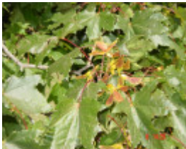
T11436 Acer platanoides