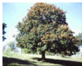
T11436 Acer platanoides