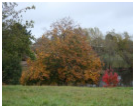
T11436 Acer platanoides