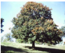
T11436 Acer platanoides