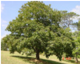
T11436 Acer platanoides