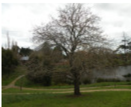
T11436 Acer platanoides