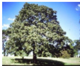
T11436 Acer platanoides