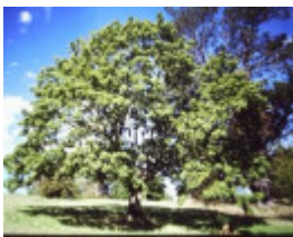
T11436 Acer platanoides