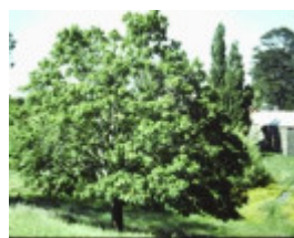
T11436 Acer platanoides