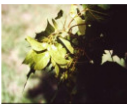
T11436 Acer platanoides