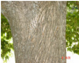
T11436 Acer platanoides