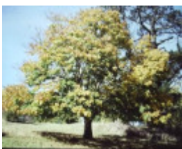
T11436 Acer platanoides