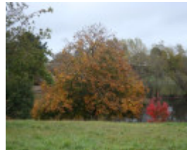
T11436 Acer platanoides