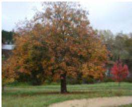
T11436 Acer platanoides