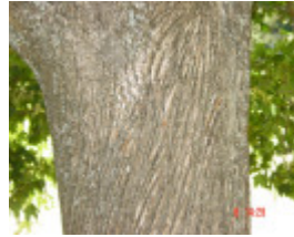
T11436 Acer platanoides