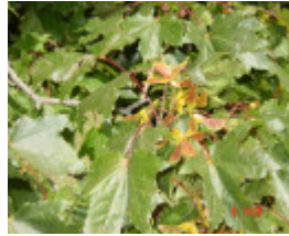
T11436 Acer platanoides