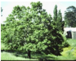
T11436 Acer platanoides