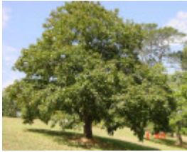
T11436 Acer platanoides