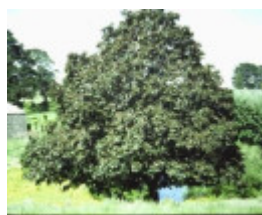
T11436 Acer platanoides