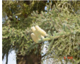
T11437 Abies pinsapo