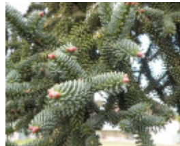
T11437 Abies pinsapo