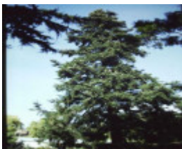
T11437 Abies pinsapo