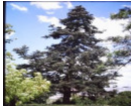
T11437 Abies pinsapo