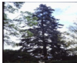
T11437 Abies pinsapo