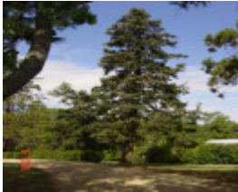
T11437 Abies pinsapo