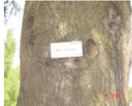
T11437 Abies pinsapo