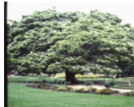
T11462 Catalpa bignonioides