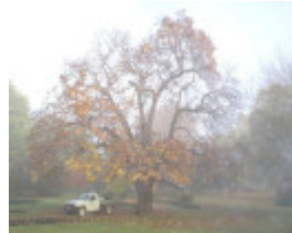
T11462 Catalpa bignonioides