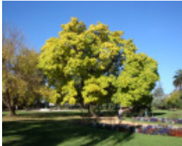
T11462 Catalpa bignonioides