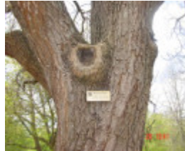
T11462 Catalpa bignonioides