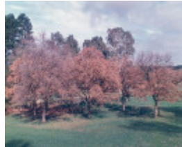
T11471 Quercus macrolepis