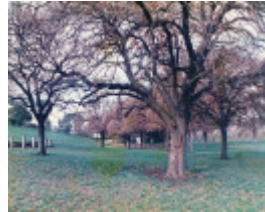
T11471 Quercus macrolepis