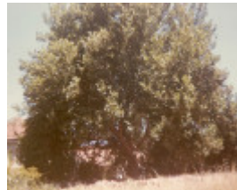
T11483 Platanus x acerifolia