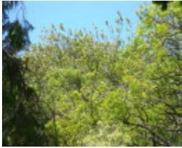
T11483 Platanus x acerifolia