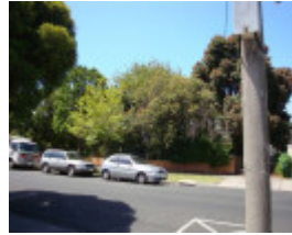
T11483 Platanus x acerifolia