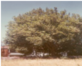
T11483 Platanus x acerifolia