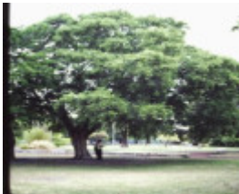
T11485 Combretum caffrum