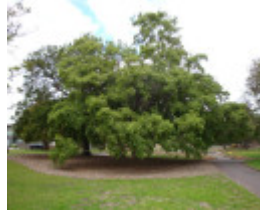
T11485 Combretum caffrum