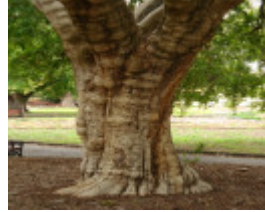
T11485 Combretum caffrum