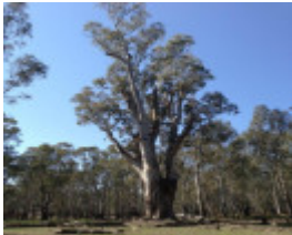
T11488 Eucalyptus camaldulensis