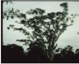
T11488 Eucalyptus camaldulensis