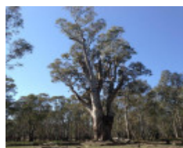
Cohuna Gunbower Island September 2013 011.jpg