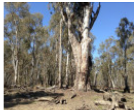
Cohuna Gunbower Island September 2013 009.jpg