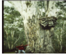
T11488 Eucalyptus camaldulensis