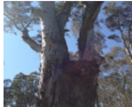
Cohuna Gunbower Island September 2013 012.jpg