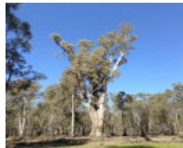
Cohuna Gunbower Island September 2013 008.jpg