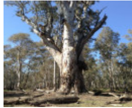
T11488 Eucalyptus camaldulensis