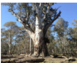
Cohuna Gunbower Island September 2013 010.jpg