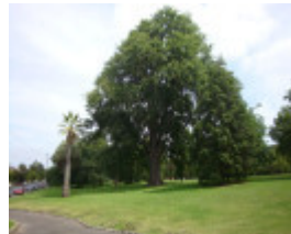
T11505 English Elm