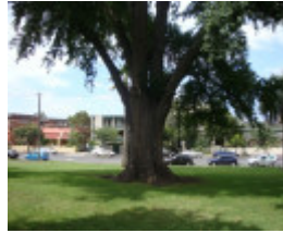
T11505 English Elm