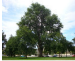
T11505 English Elm