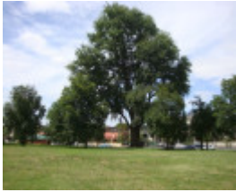
T11505 English Elm