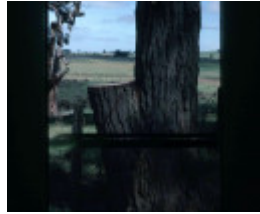
T11511 Pinus radiata Smeaton House Private Cemetery