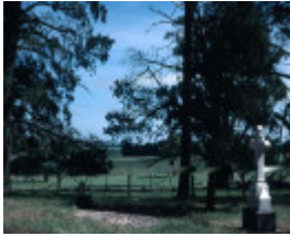
T11511 Pinus radiata