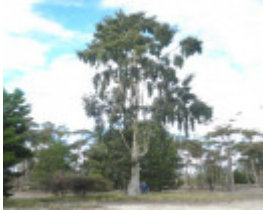
T11541 Corymbia maculata