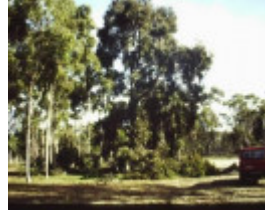
T11541 Corymbia maculata