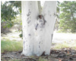
T11541 Corymbia maculata