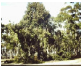
T11541 Corymbia maculata