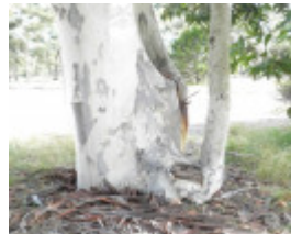
T11541 Corymbia maculata