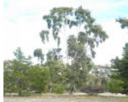
T11541 Corymbia maculata