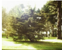
T11570 Hesperocyparis macrocarpa hodginsii