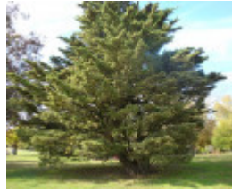
T11570 Hesperocyparis macrocarpa hodginsii