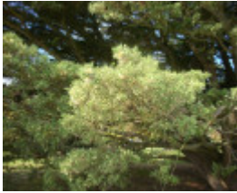
T11570 Hesperocyparis macrocarpa hodginsii