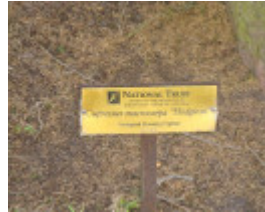
T11570 Hesperocyparis macrocarpa hodginsii