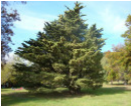
T11570 Hesperocyparis macrocarpa hodginsii