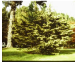
T11570 Hesperocyparis macrocarpa hodginsii