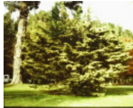
T11570 Hesperocyparis macrocarpa hodginsii