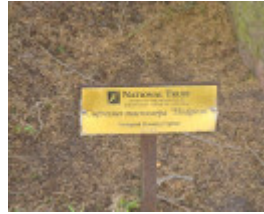
T11570 Hesperocyparis macrocarpa hodginsii