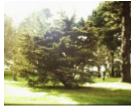
T11570 Hesperocyparis macrocarpa hodginsii