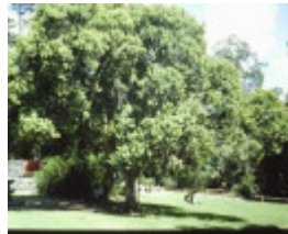
T11574 Angophora hispida