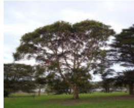
T11574 Angophora hispida