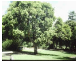
T11574 Angophora hispida