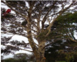
T11574 Angophora hispida