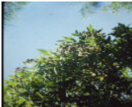
T11574 Angophora hispida