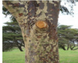
T11574 Angophora hispida