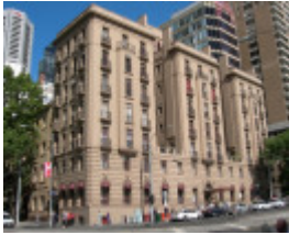
ALCASTON HOUSE SOHE 2008