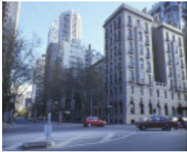
1 alcaston house collins street melbourne side view