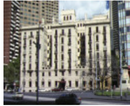
alcaston house collins street melbourne front view