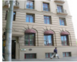
ALCASTON HOUSE SOHE 2008