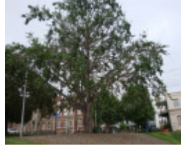
T11620 Ginkgo biloba