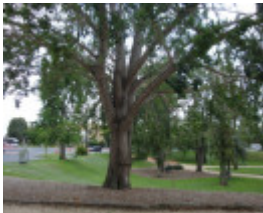
T11620 Ginkgo biloba