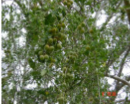
T11620 Ginkgo biloba