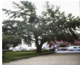
T11620 Ginkgo biloba