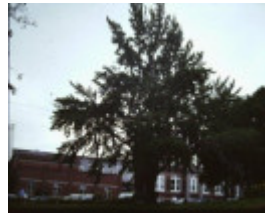
T11620 Ginkgo biloba