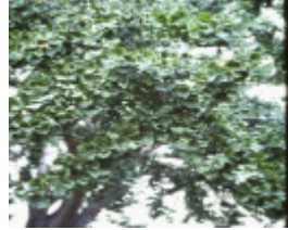
T11620 Ginkgo biloba