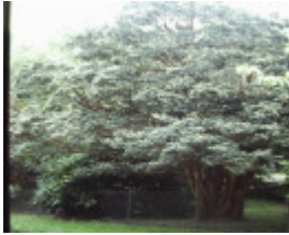
T11647 Luma apiculata