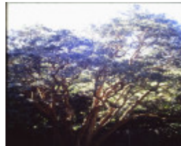
T11647 Luma apiculata