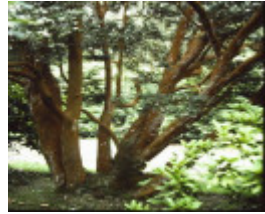
T11647 Luma apiculata