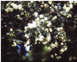
T11647 Luma apiculata